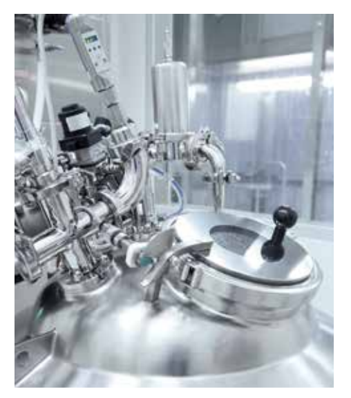
Temperature sensor with fermenter connector