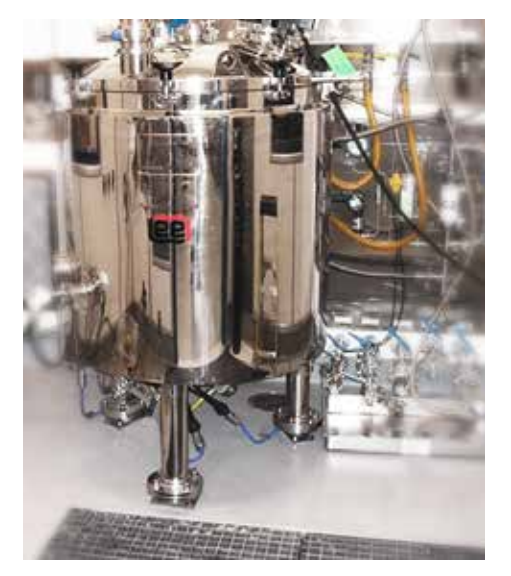
Content control for process vessels and tanks