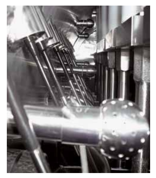
Conductive point level switch for pipes and vessels