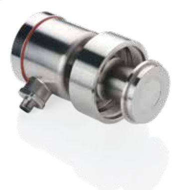
Pressure measurement in pipes and vessels