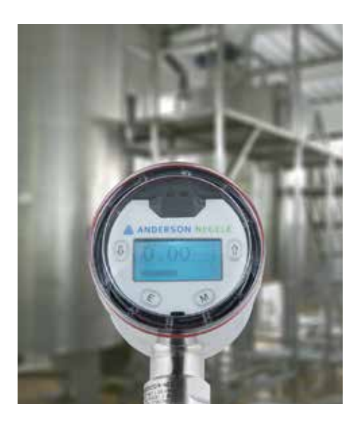
Modular pressure and level sensor