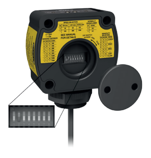
Easy Accessible DIP-Switches