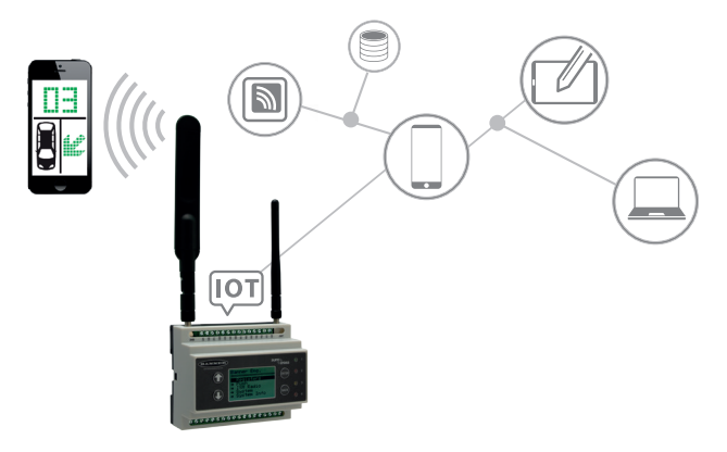
Extended Connectivity to Smart Devices For detailed product information, see page 13.