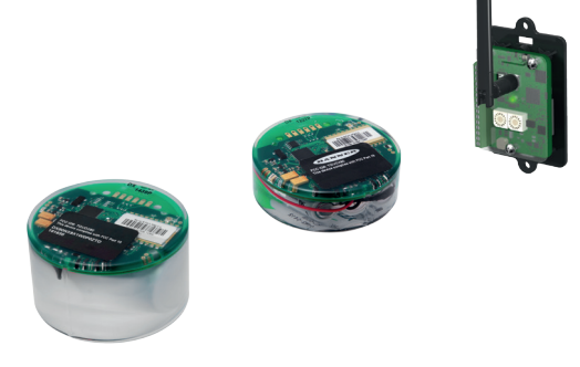
M-GAGE Parking Sensors For detailed product information, see pages 10 and 12.