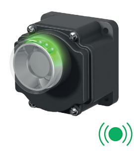
Light Node For detailed product information, see pages 11 and 12.