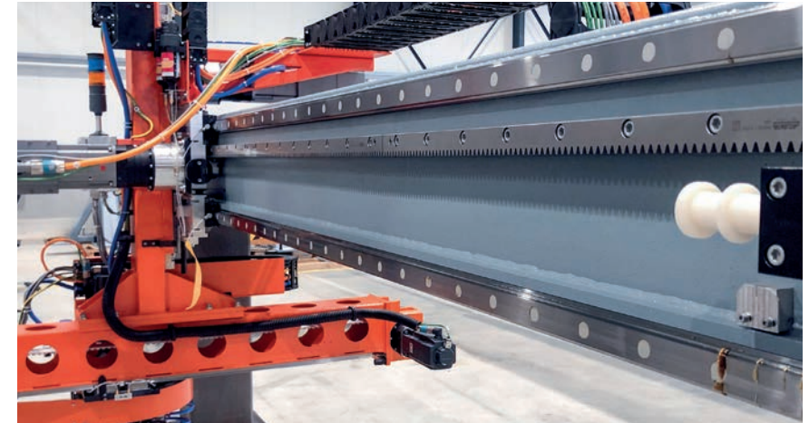
THK linear motion guides in use: The system ensures precise handling and welding of car body panels.

to selection options and targeted advice. In a first round, the Bachofen experts for motion technology put the THK linear motion guides of the HSR series up for discussion. As their performance exceeds the actual requirements of the application on closer inspection, Bachofen demon-